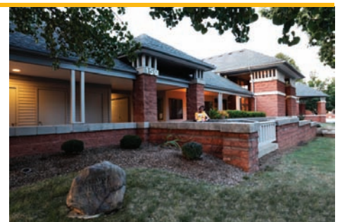
Creative Living II 150 W. 10th Avenue, Columbus, OH 43201 Est. 1986

MISSION STATEMENT: Creative Living is a nonprofit organization encouraging independent living for adults with severe physical disabilities by providing wheelchair accessible housing and assistance and by creating a supportive environment for people to learn, work, live, and contribute to the community.