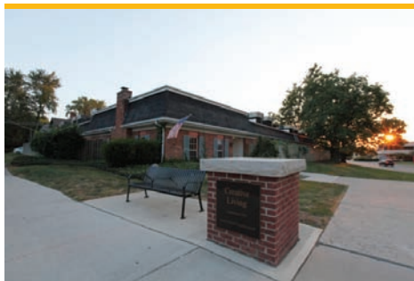
Creative Living I 1531 Perry Street, Columbus, OH 43201 Est. 1974

We host four events each year – Bouquet of Flavours wine-tasting, Creative Living 5k Run/1 mile walk , Creative Living Golf Classic and Brew Review , a night of craft beer tasting. We also need and appreciate the in-kind support and services from our community, including wonderful volunteers.